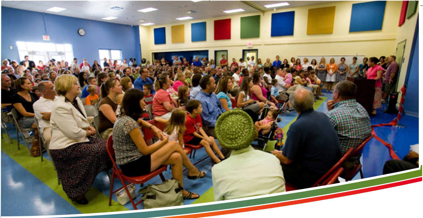
Eric Crossan Photography