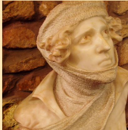
Alabaster carving from The Museo Storico dell'Alabastro (Historic Alabaster Museum) housed in a restored 12th century convent in Volterra.

representatives from the Town of Volterra and explore international resources that could be shared in the classroom. When Petrella mentioned the idea of collaborating on an Artist In Residence Program, her request was met with enthusiastic support. Details of the visit will be formalized later this fall when Dottore